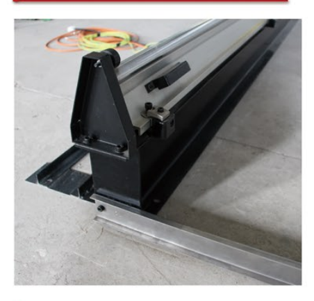
High definition THC