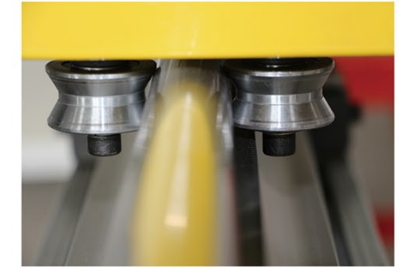
Capacitive THC and ARC Voltage THC